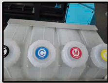
Bulk Ink Supply System