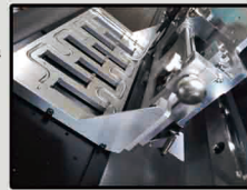
Carriage Height adjustable