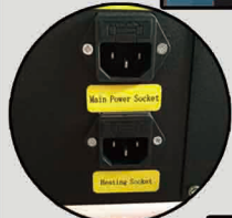
Separate Machine & Heater Power