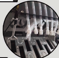
Ink Circuit Heating System