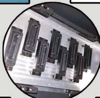
Printhead Moisturizing System