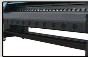
Separate Infrared Heating System