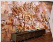
Decoration Wall Paper