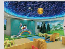
Soft Film And Wallpaper