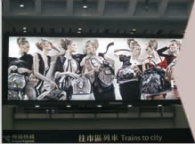
Backlit Bill Board