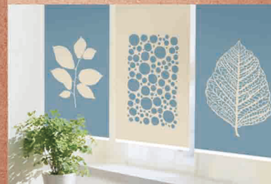
Customized Abat Vent