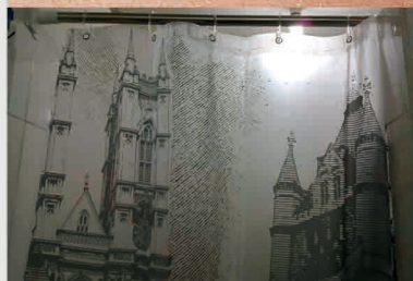
Shower Curtain Decoration